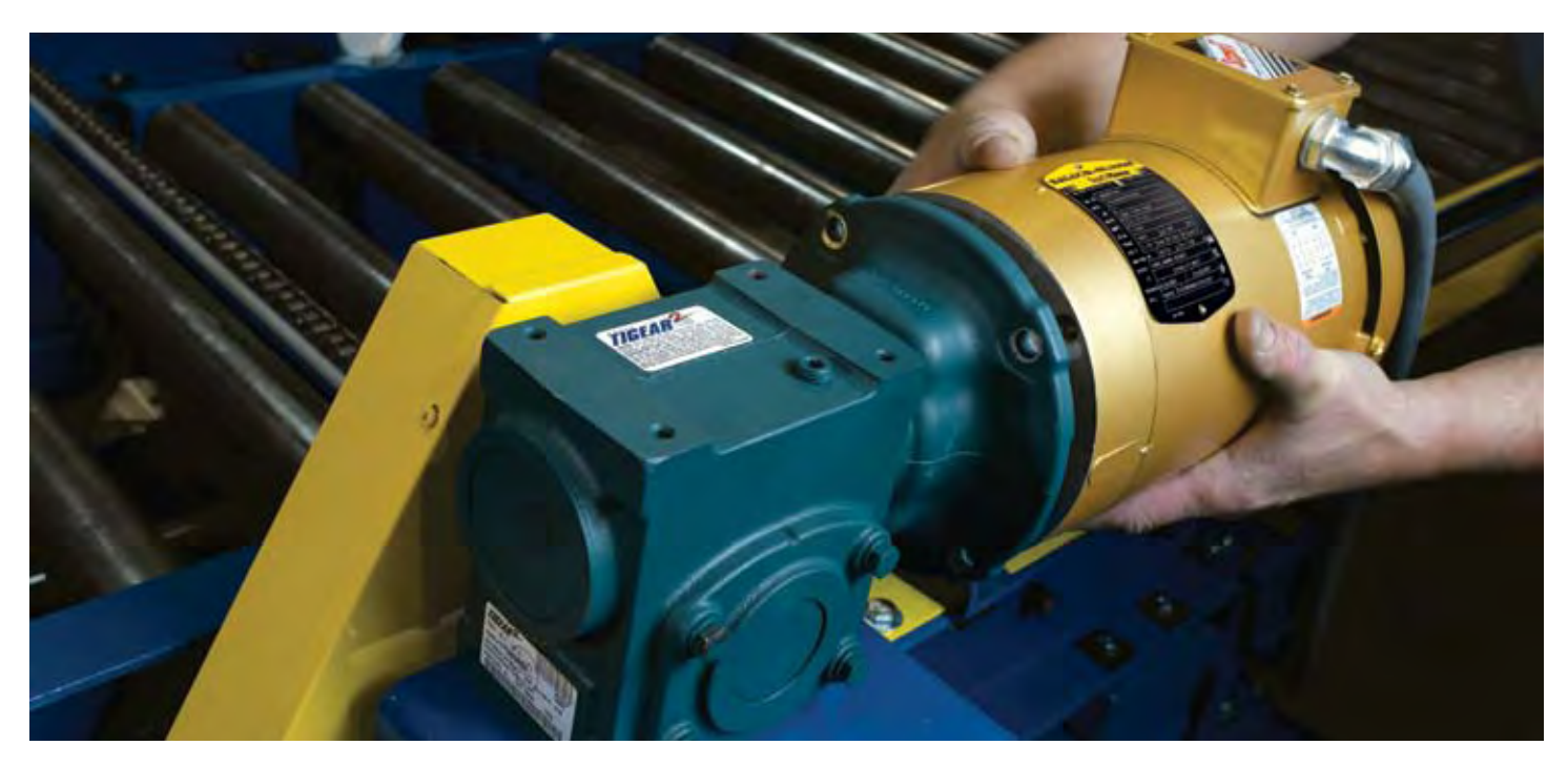
Alba officials made the switch to Baldor Dodge Tigear-2 reducers because this high-performance product is cost competitive with other brands, plus provides opportunities for optimization. Baldor Reliance motors are the company's top choice because they offer superior quality and performance at competitive prices.

"The reason that we do it is to show that we offer quality," says Kroeger. "It's one thing just to list that you are using a half-horsepower motor – but what kind of motor? When I list that it's a Baldor•Reliance motor and a Baldor•Dodge gearbox, I think it lends credibility and proves that we are providing a quality product to our customers."