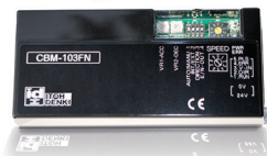
CBM-103 Standard Driver Card